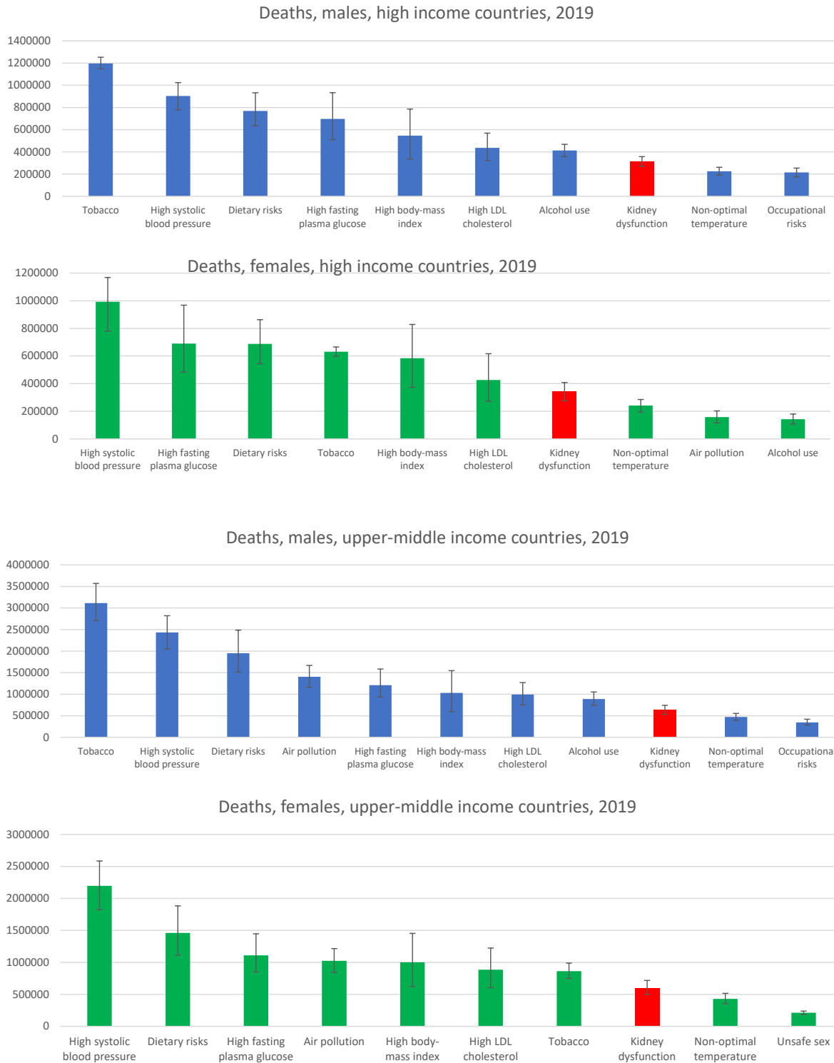
Supplementary Figure 1. Ranking of kidney dysfunction as a cause of death stratified by world-income category and gender by level 2 risk factors for death.